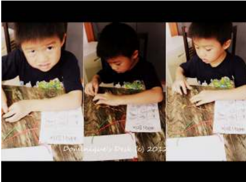
Doggie boy was the first one to try out the stix after my demonstration. You can see him here trying to create his own masterpiece.