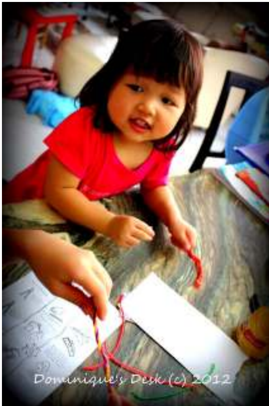
Tiger girl wanted to get her hands on some sticks and was eagerly watching to see how her brothers were making their masterpieces with it so she could follow suit.